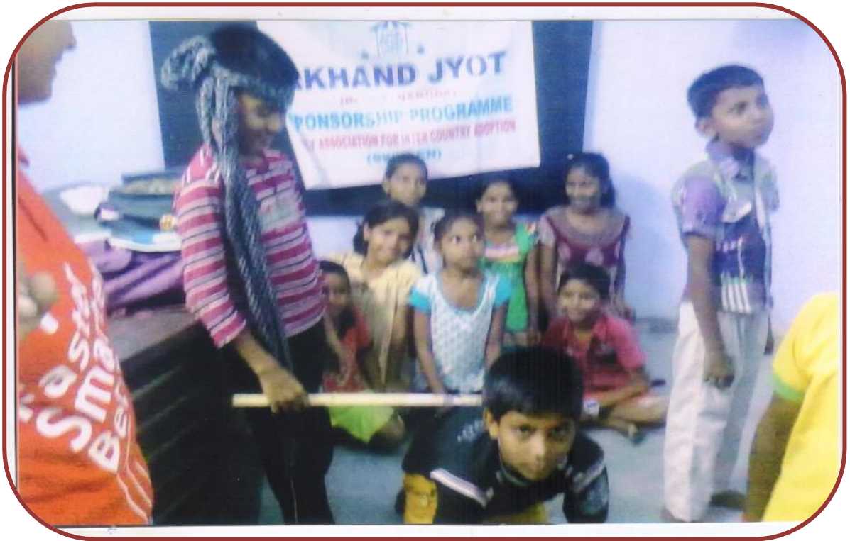
Children Enacting Play 26 th January Celebrations