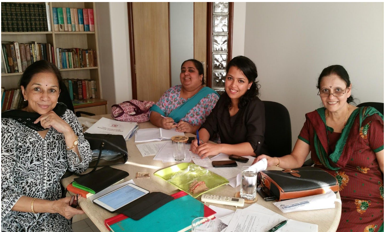
Some of the SPARCC social work team