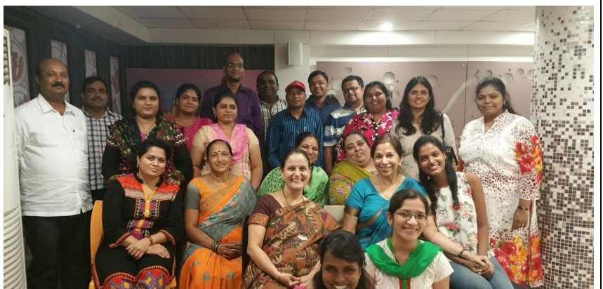
Adoption Workshop Participants