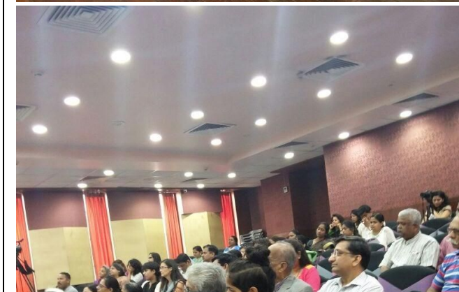
The Audience at the 'Adoption with Awareness' workshop