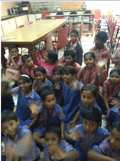
SPARCC activities at Sant Ghatge Maharaj School, Pune