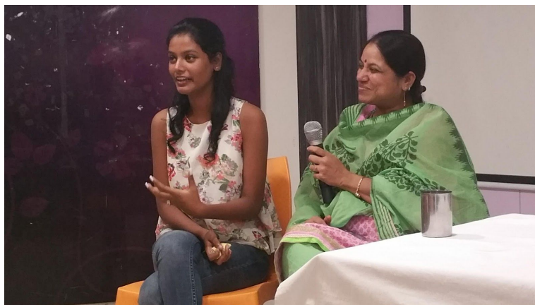
Adopted mother and daughter share their experiences