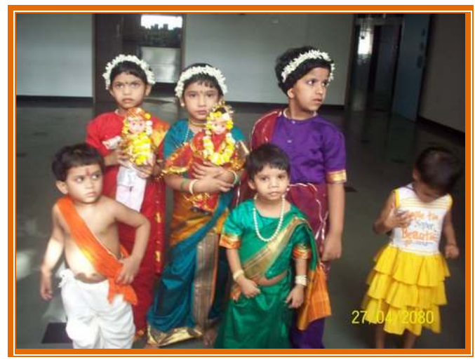
All of them were so excited about the Doll's wedding and enjoyed thoroughly