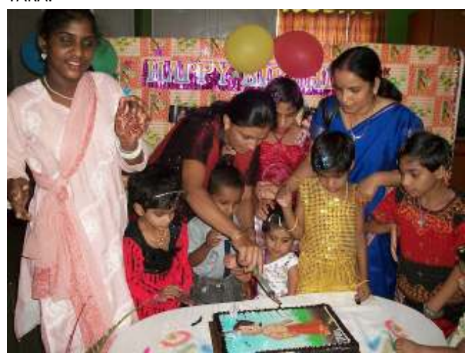
14<sup>th</sup> May- TARA stepped into its fourth year

On 14<sup>th</sup> May 2012 TARA celebrated its fourth anniversary year along with its staff and other members of SOFOSH. Gifts were distributed to the working staff and children at TARA.